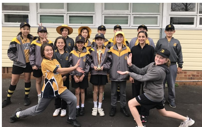
Birrong's fabulous Band!